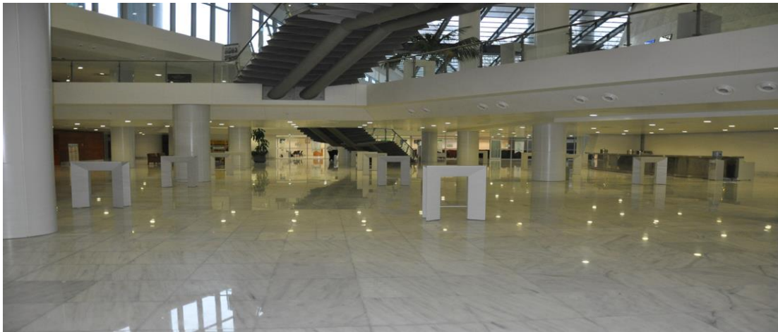
Exhibition Fair and Coffee Break Area (Outside Hudavendigar Conference Saloon)